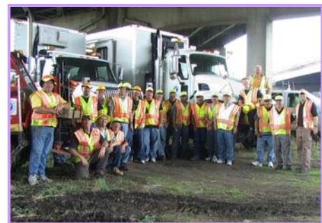
Participants in MnDOT Course